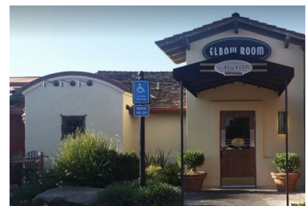
The Elbow Room

$5 Discounts for Chapter Members, Veterans, Students, and First-Time Attendees